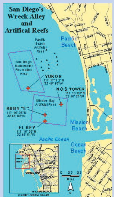
FIGURE 1 Using U.S. Navy studies and bathymetric maps, SDOF chose the Yukon's new home in Wreck Alley.

Also, because the Yukon is almost 100 feet tall, it would create a navigational hazard if sunk at this depth. Therefore, we had to remove about 20 feet of the aluminum signal mast during the ship preparation phase.