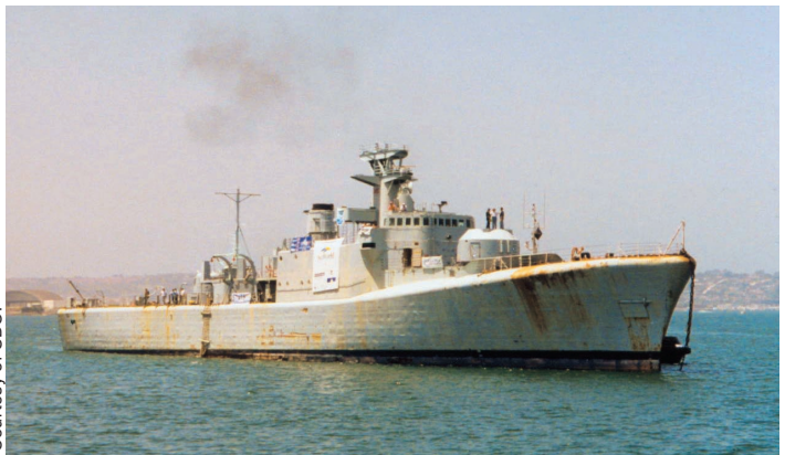
On May 6, 1999, the Yukon made her final journey into San Diego Bay by tug (above). The following year, she was cleaned of contaminants, significantly remodeled, and thoroughly mapped in preparation for her role as an artificial reef (below).