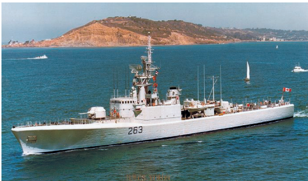
With Point Loma in the background, the HMCS Yukon leaves San Diego in 1963 for exercises.

As a member of the Project Yukon Safety Committee, I had volunteered to complete the mapping tasks during a meeting in February 1999. An avid diver and dive instructor with a keen interest in the environment, as well as a GIS professional, I knew nothing about the layout of a destroyer class ship. That would all dramatically change in the months to come.